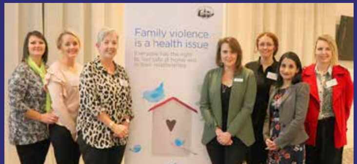
Pictured: Strengthening Hospitals Response to Family Violence Team

The successful event was coordinated through the Strengthening Hospital Responses to Family Violence project and was well supported by local partner organisations.