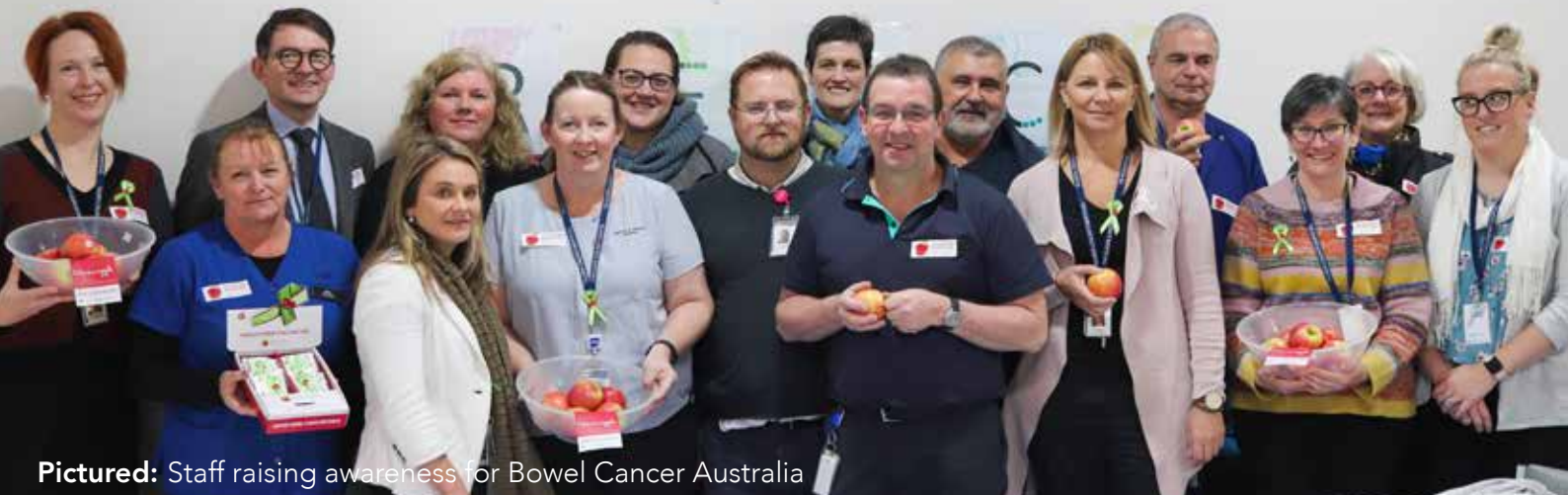
Pictured: Staff raising awareness for Bowel Cancer Australia